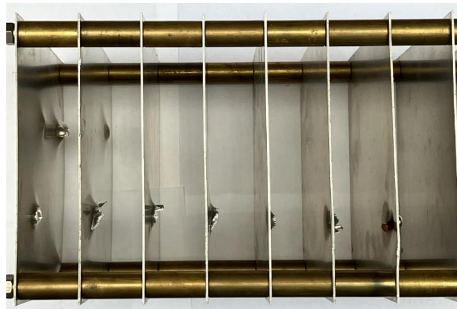
Pic 3 Penetration of sheets

The penetration test jig is used for comparison of projectiles ability to penetrate alloy sheets comparing bullet shapes velocity and weight.